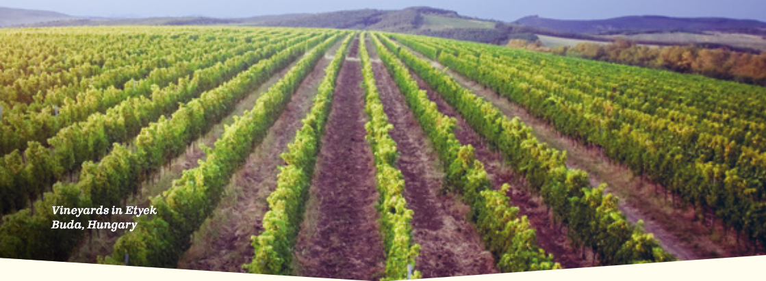
Vineyards in Etyek Buda, Hungary